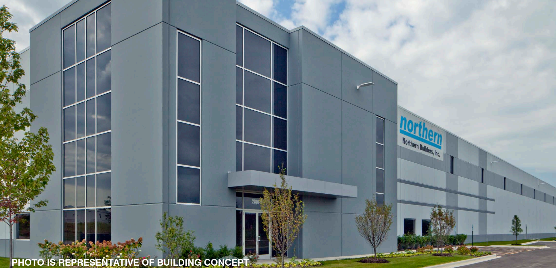
PHOTO IS REPRESENTATIVE OF BUILDING CONCEPT